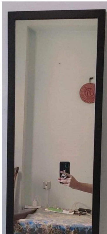
Mirror Pic Ref: